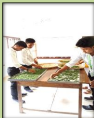
Fig 5: Placing the tea leaves in the tray