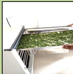
Fig 6: Inserting the tray