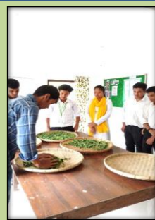
Fig 4: Hand rolling