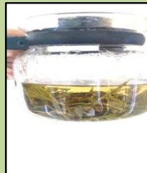
Fig 8: Green tea liquor