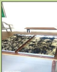
Fig 7: Made Tea