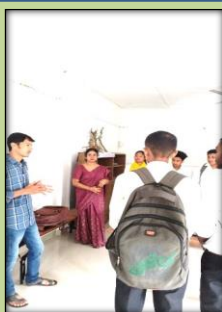
Fig 1: Interaction with the students