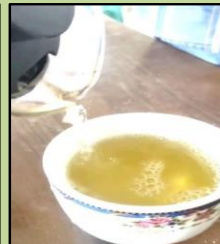
Fig 9: A Cup of Green tea